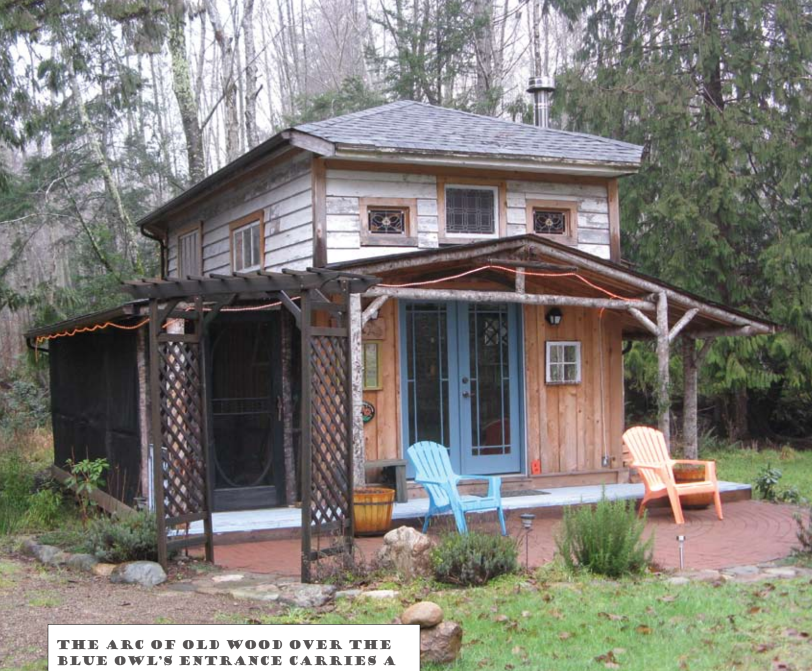
THE ARC OF OLD WOOD OVER THE BLUE OWL'S ENTRANCE CARRIES A LOT OF HISTORY